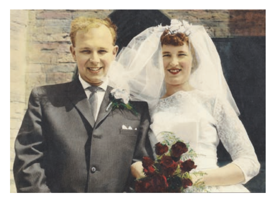
Order of Service