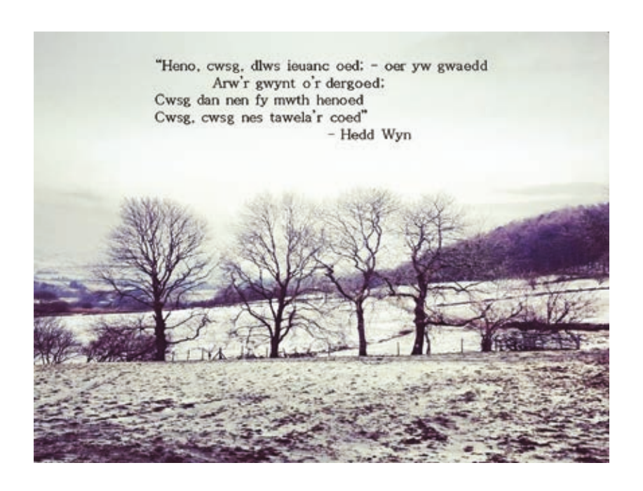
"Sleep tonight, a cold blows through the oak trees, Sleep under the canopy of my ancient cottage, Sleep til the trees quieten." - Hedd Wyn