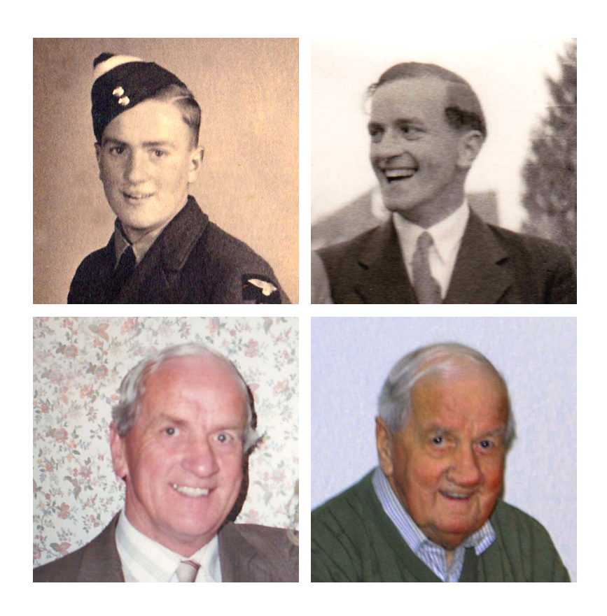
St Peter's Chapel, Exeter & Devon Crematorium Friday 27th November 2015 at 2.45pm