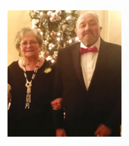
POEM You Can Shed Tears

MUSIC FOR REFLECTION What Colour Is The Wind Charlie Landsborough