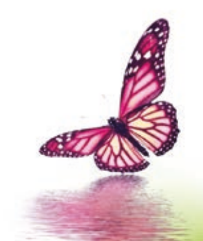
Departing Music Swan Lake, Op. 20, Act 2: No. 14, Scene (Moderato) by Pyotr Ilyich Tchaikovsky London Symphony Orchestra