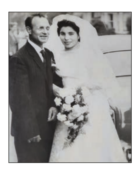
The funeral service will be live streamed at www.derbycatholiclive.co.uk

The family would like to thank everyone for their kind words and support at this sad time.