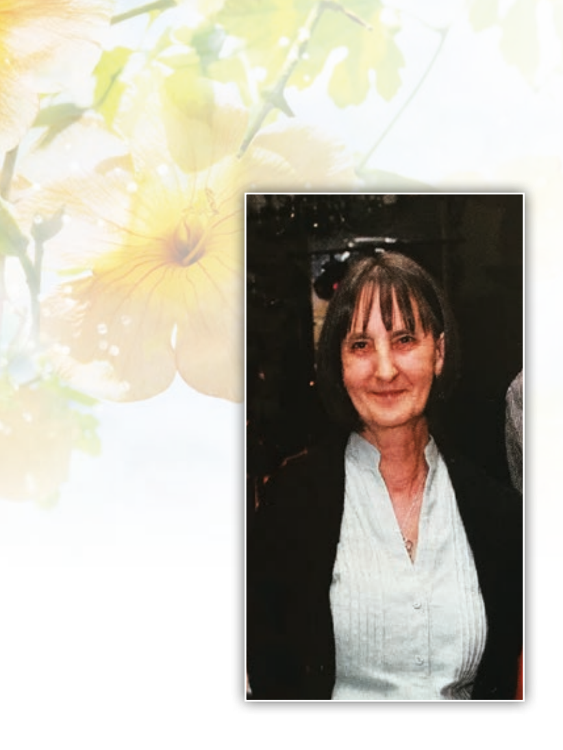
EULOGY prepared and delivered by Rebecca White