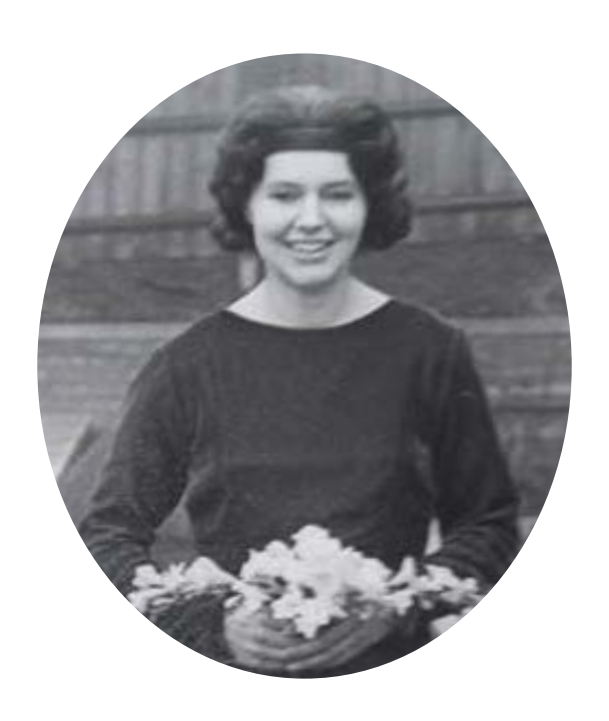
In Loving Memory of