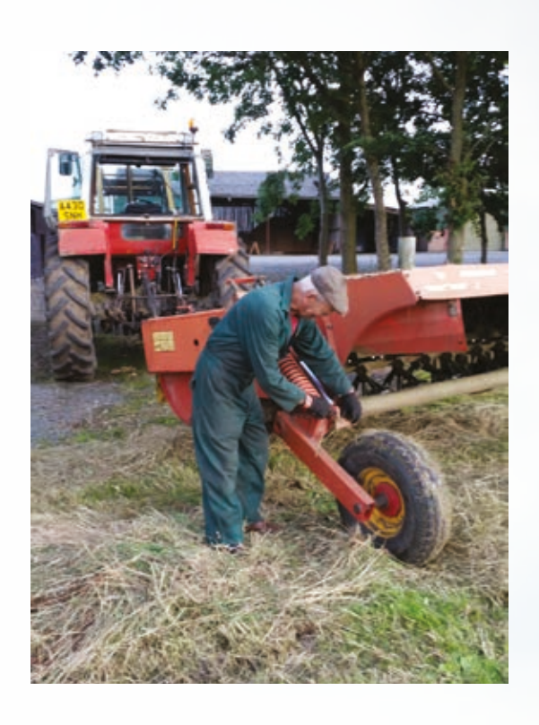
\label{eq:POEM} POEM Not How Did He Die, But How Did He Live?

Not how did he die, but how did he live? Not what did he gain, but what did he give? These are the units to measure the worth Of a man as a man, regardless of his birth.