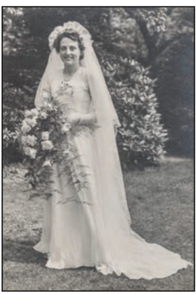
ENTRANCE MUSIC Moonlight Serenade - Glenn Miller