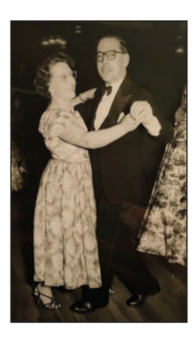
In the mood'

The family would like to thank everyone for their kind words and support at this sad time.