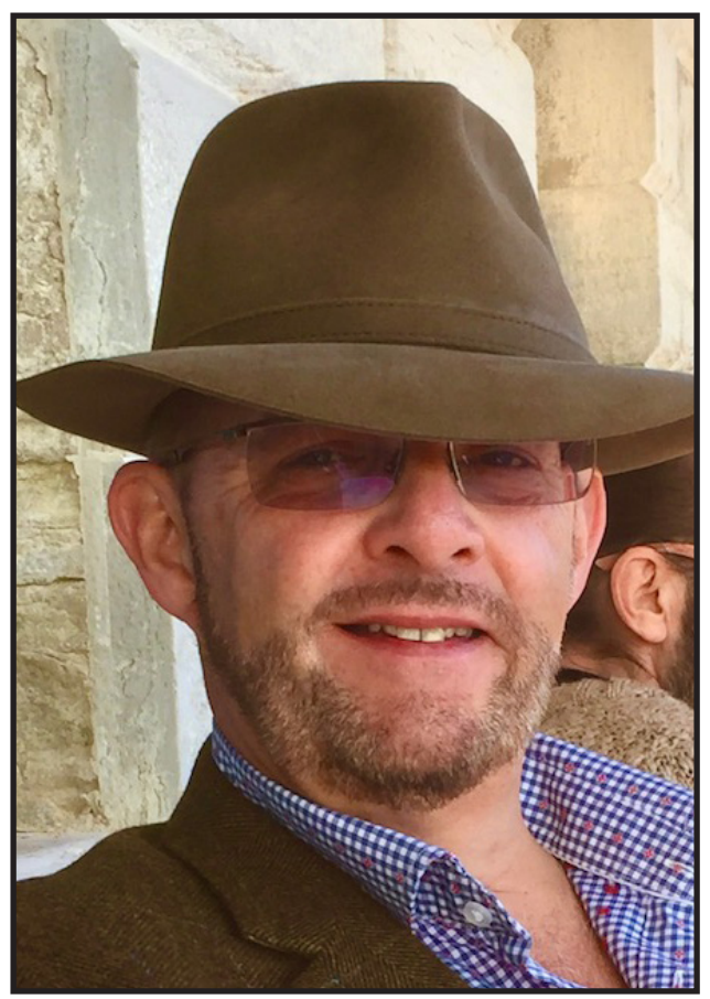
6<sup>th</sup> February 1960 ~ 28<sup>th</sup> February 2022