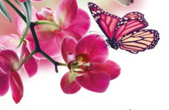
Order of Service service conducted by Trevor Brownley, Civil Funeral Celebrant