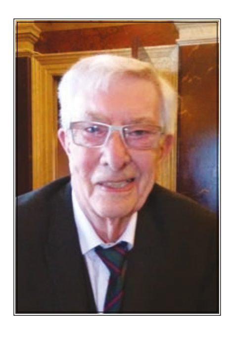
To Celebrate the Life of