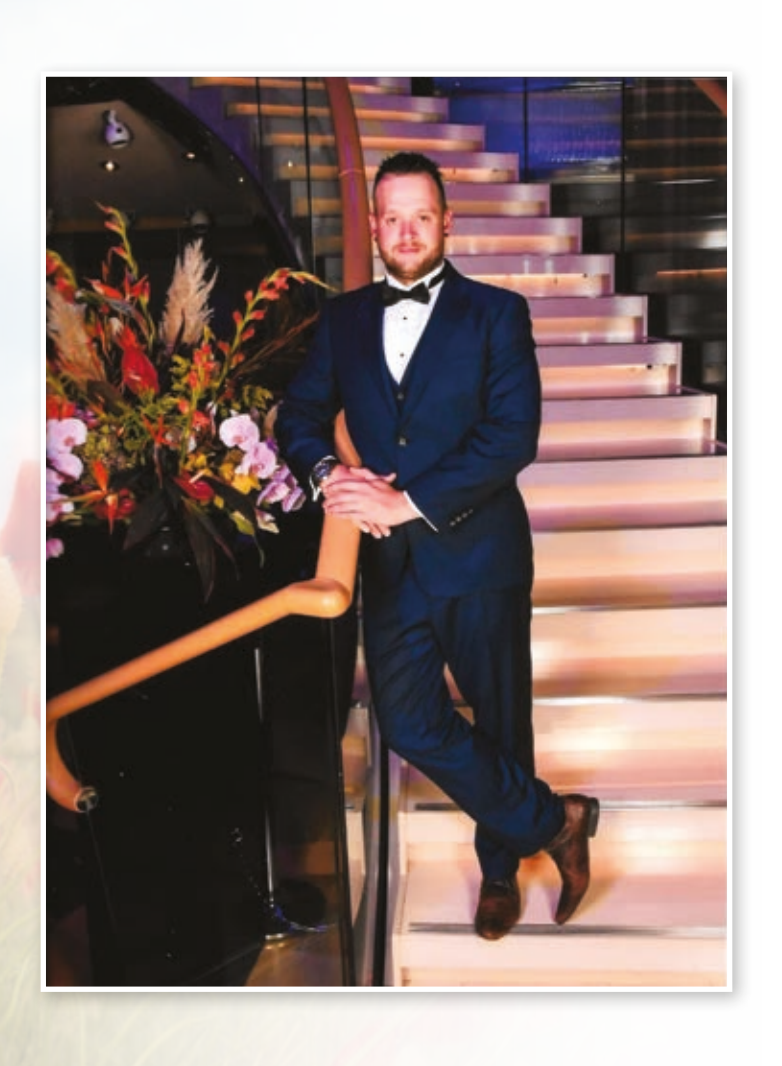
MUSIC 'Take Me Away' by 4 Strings