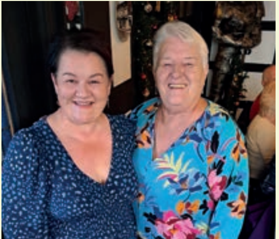
Emma's Celebration of Life