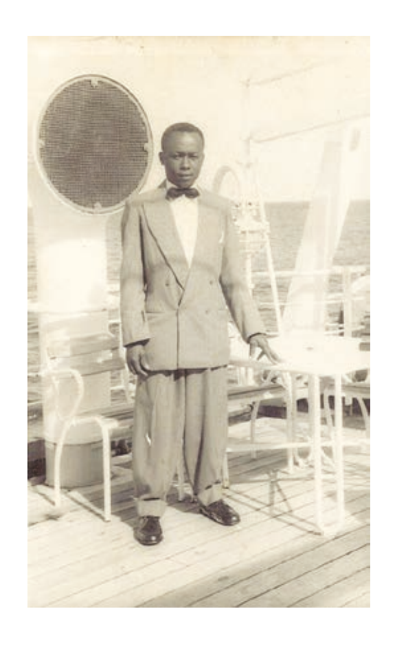
Order Of Service