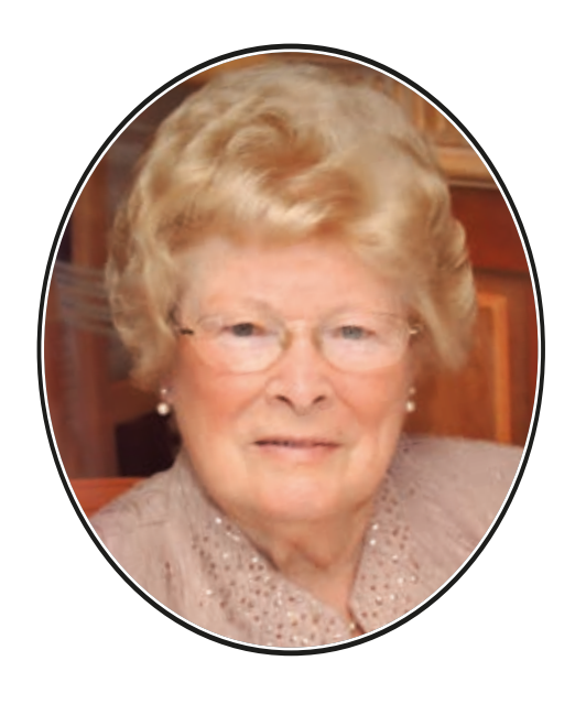
In Loving Memory of