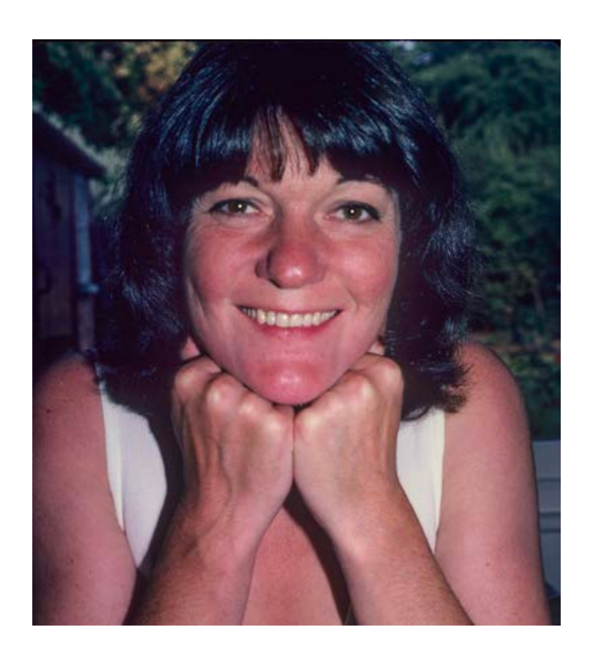
Wilford Hill Crematorium Thursday 11th May 2023