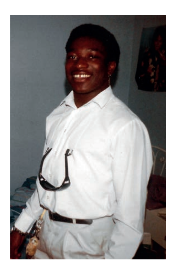
The interment will take place at: 1.30 pm Northern Cemetery, Hempshill Lane, Bulwell, Nottingham NG6 8PF.

A warm invitation is extended to all present to join us at The Greyfriars, Gordon Road, Thorneywood NG3 2LG for refreshments.