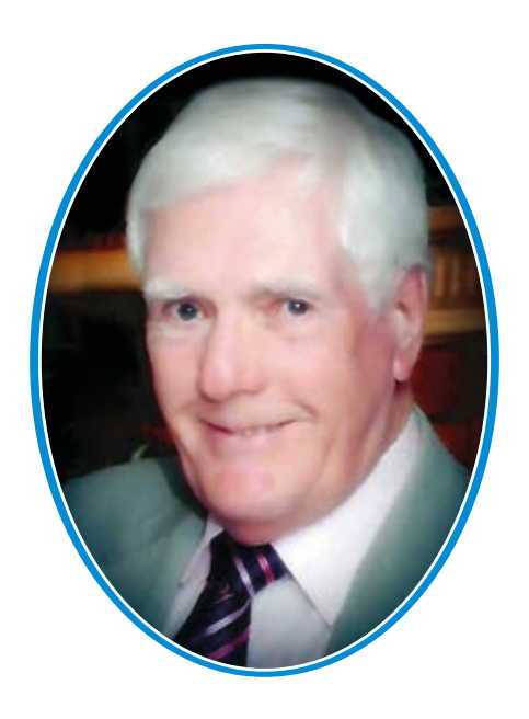
To Celebrate the Life of