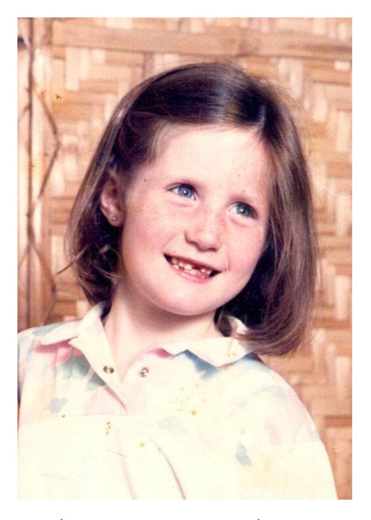
Friday 21st September 2018 1:00pm St. Pauls Chapel Exeter & Devon Crematorium