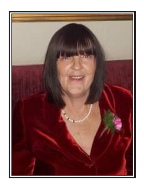
CITY OF LONDON CEMETERY