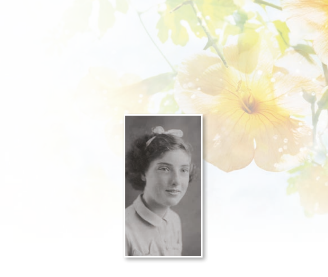
SCRIPTURES OF HOPE