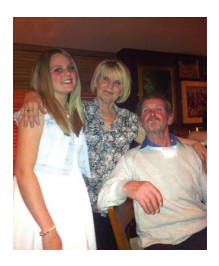
RECESSIONAL MUSIC Can't Help Falling In Love performed by Roy's great-granddaughter, Betsey