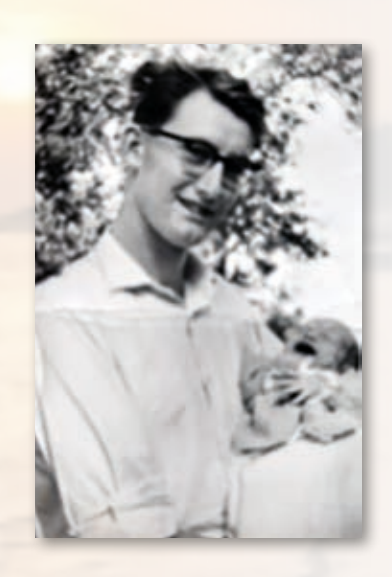
Order of Service