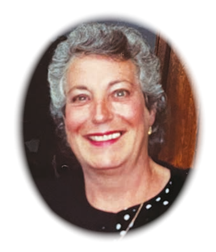
Tuesday 18th July 2023 at 3.30 pm