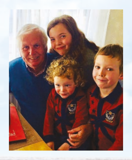
POEM A Grandfather Like You

We wanted you to know You meant the world to us three, Only a heart as dear as yours Could give so unselfishly.