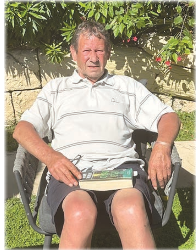
"And it's goodnight from him"