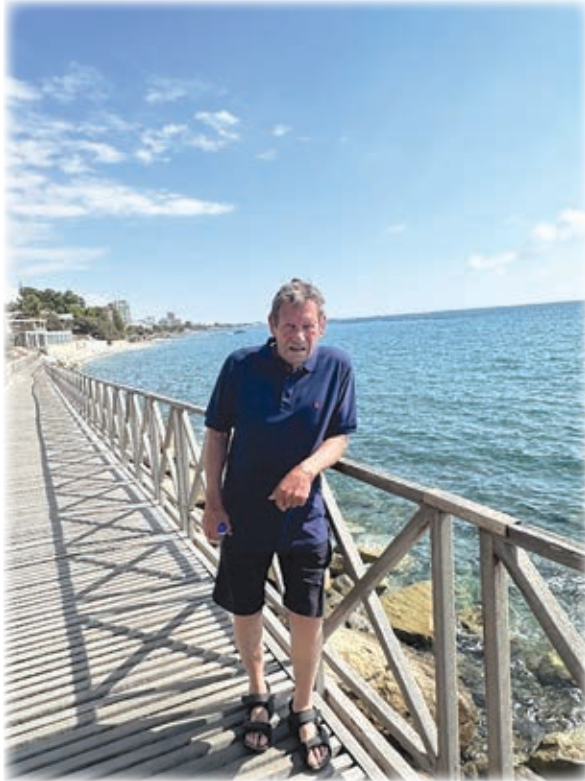
ENTRANCE MUSIC Theme from Fawlty Towers