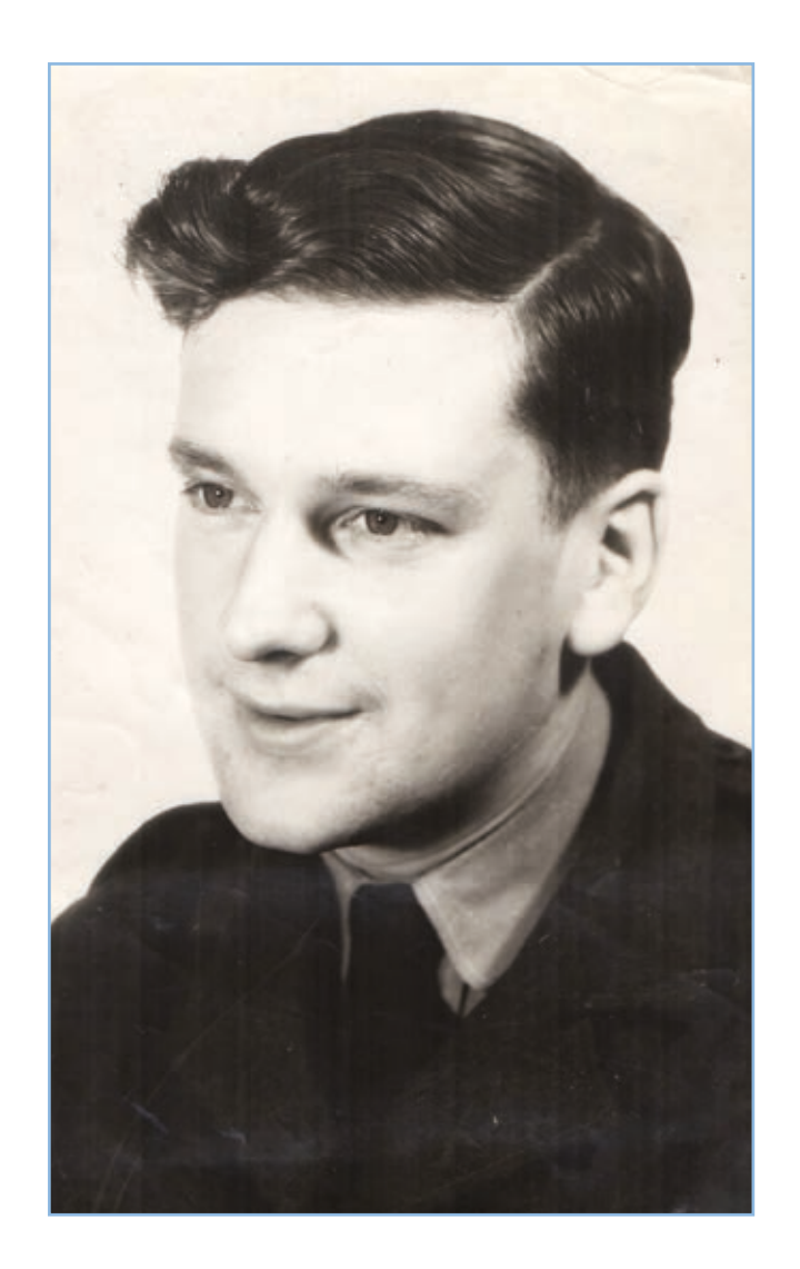
Order of Service

ENTRANCE MUSIC 'Songbird' by Eva Cassidy