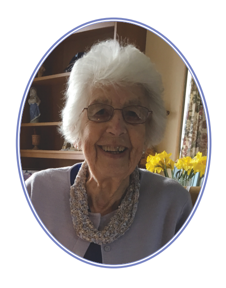
In Loving Memory of