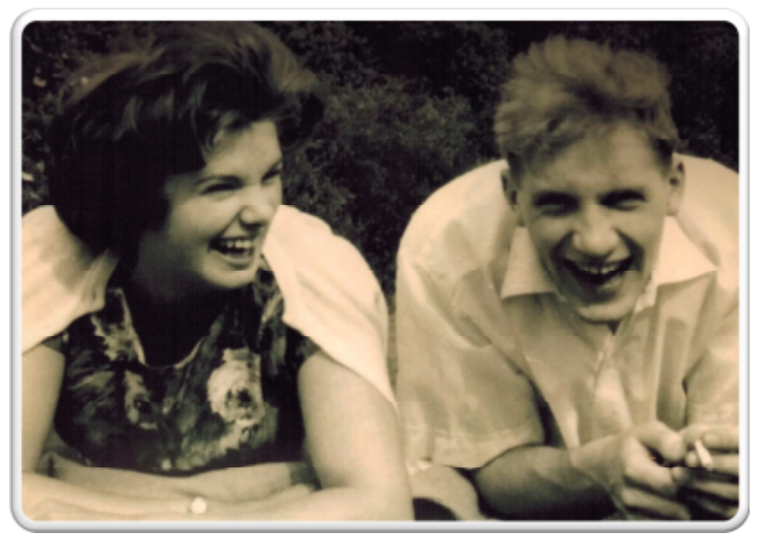
Celebrating 80 Spectacular Years!

Our Father, who art in heaven, hallowed be thy name; thy kingdom come; thy will be done; on earth as it is in heaven. Give us this day our daily bread. And forgive us our trespasses, as we forgive those who trespass against us. And lead us not into temptation; but deliver us from evil. For thine is the kingdom, the power and the glory, for ever and ever. Amen.