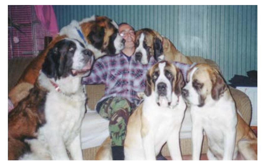
The family would like to thank everyone for their kind words and support at this sad time.