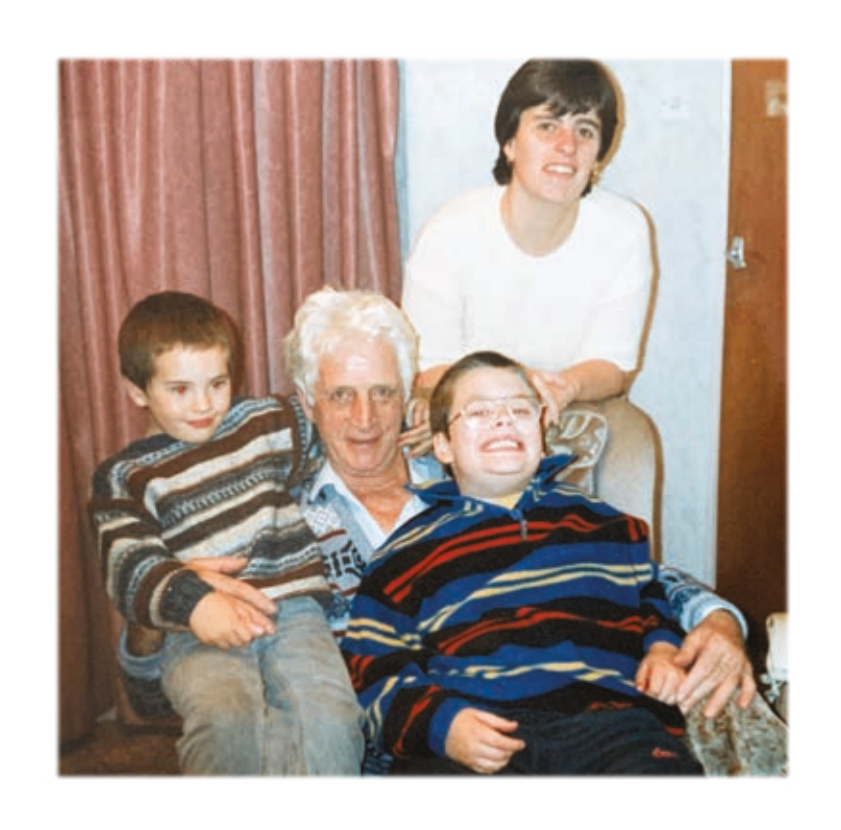
PRAYERS OF RESPONSE